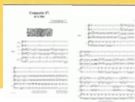
Concerto 17 - Cover page

This longer concerto in G consists of three movements. It is written for 2 trumpets and the church trio.